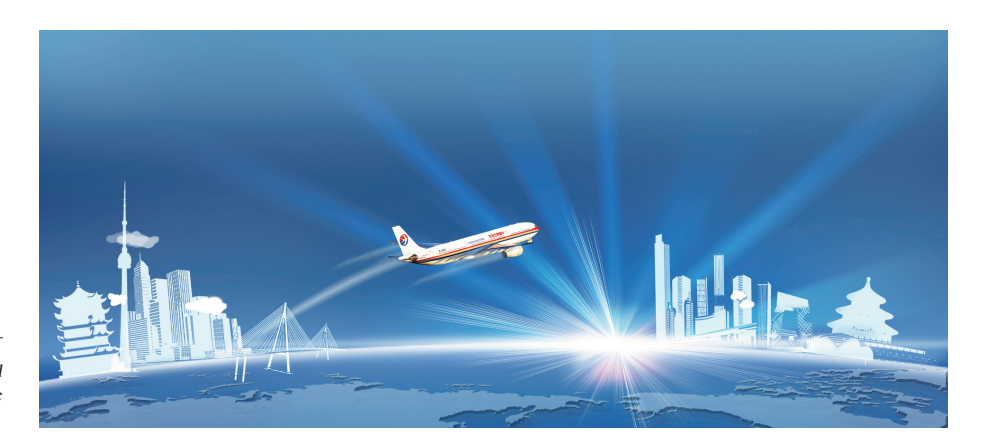
Airport economy is the strategic need to upgrade the Chinese economic development.

more employment entering the city, and greatly improved the new agricultural modernization in Henan. Meanwhile, in priority to the development of green industry, the ZAEZ has focused on the development of high-end services and a smart city. It has formed a new green metropolitan by taking full advantage of the Affore stration Garden of Zhengzhou. Currently, a supercomputing center is under construction and the Internet plus is under implementation. ZAEZ is developing its smart information, services and economies, such as the Internet, the Internet of Things, cloud computing and big data, which will enable ZAEZ to become a leading informational and technical metropolis.