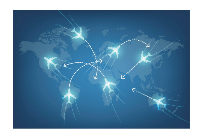
International hub airports have the fastest and widest range of the global route network.

Airport economy is an open system that consists of many open elements. It connects major cities both in China and abroad by using the airport route network. High quality economic factors such as capital, information, technology and talents are circulated in the airline network and quickly integrated into the global economy,